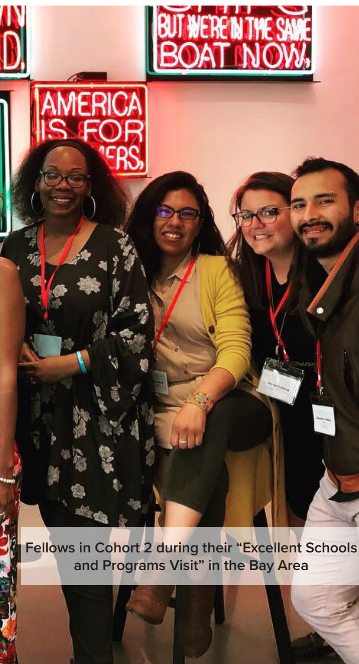
Fellows in Cohort 2 during their “Excellent Schools and Programs Visit” in the Bay Area

In 2021, the Moonshot Residency Program was launched as a full-time, intensive program designed for Moonshot edVentures Fellows who are committed to launching and leading high-quality new charter schools. Four Fellows representing three schools made up our inaugural cohort with plans to launch schools in Denver County, Adams 14, and Jefferson County.